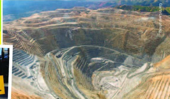
Geetha Lavee photo